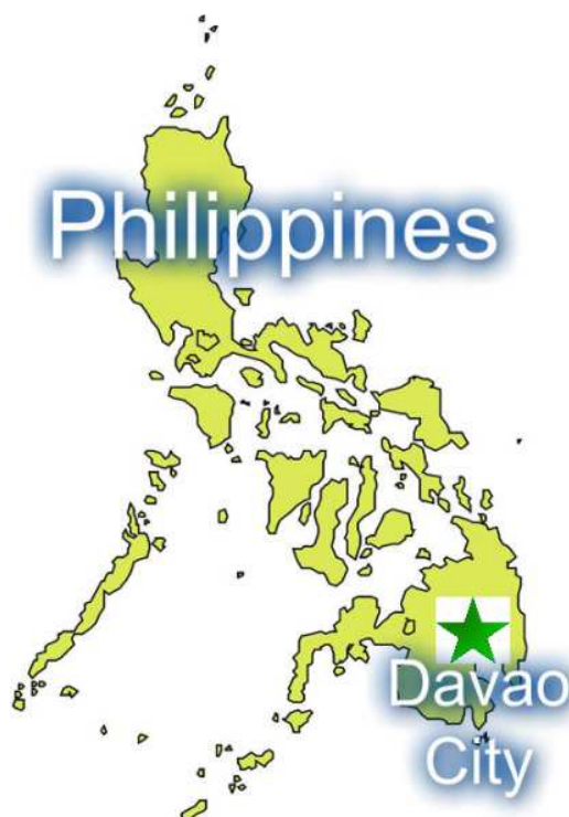
Figure 2. Map of the Philippines highlighting Davao City Police Office.

The researcher believed that the adult residents or those in the age of majority are the suitable respondents wherein they can fully express themselves and can answer the general and specific research objectives of the study. Minors and those with mentally challenged people were excluded from this study because they might not be suitable to test the study's hypothesis and answer the research questionnaire, resulting in an incorrect interpretation. Correspondingly, no individual subject should be excluded without proper justification or requirement to do so. Furthermore, all the respondents have the prerogative for voluntary participation and have the right to withdraw from the research study.